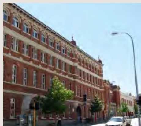
LEFT TO RIGHT: Boulder Court House, Boulder (1900-1905) Government Print Office, Perth (1894)

Disclaimer: This publication is produced and distributed by the Heritage Council as an information guide only. The State of Western Australia, the Department of Planning, Lands and Heritage and Heritage Council do not represent that this publication is error-free, comprehensive or suitable for the reader's purpose and therefore disclaims all liability for any loss, damage or liability suffered by the reader directly or indirectly.