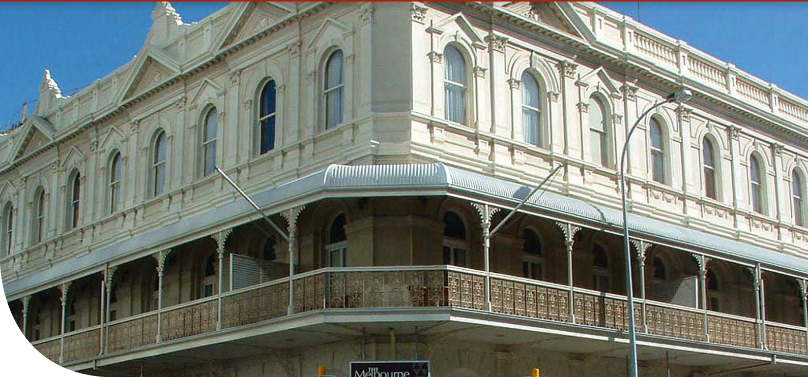
ABOVE: Melbourne Hotel (fmr), Perth