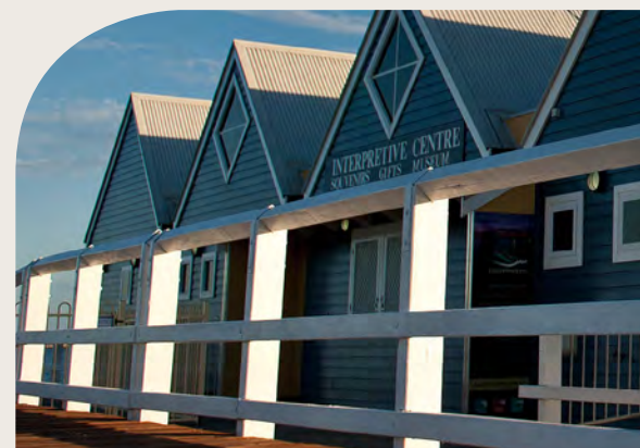
FRONT COVER: Busselton Jetty Interpretation Centre, Busselton